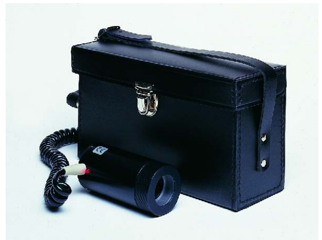
Calibration assistance for Infrared Radiation Thermometers, 100°C - radiation source Net independent with battery-pack and charger

*)Report in Journal Applied Optics, Nov. 1970, Vo. 9, Nr. 11, "The normal emittance of circular cylindrical cavities" by E.M. Sparrow and R.P. Heinisch.